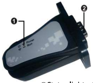
①Status light ②DB9 serial por